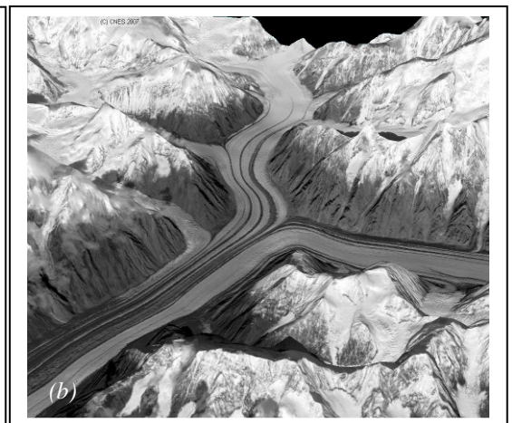
(a) SPIRIT orthoimage over Astrolabe Glacier, Adélie Land, Antarctica.